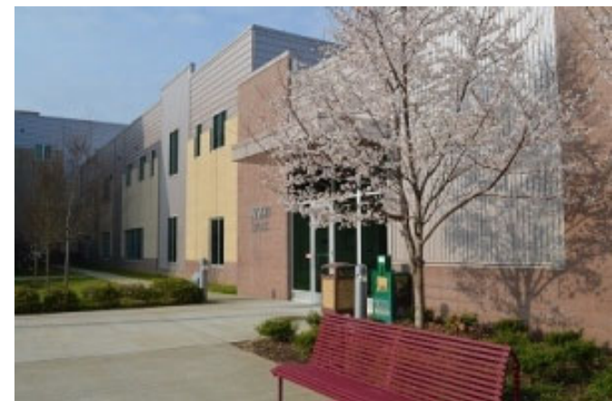
Western Mental Health Institute