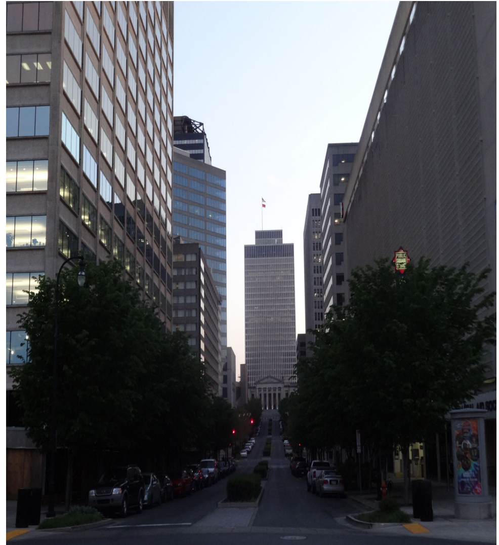
Tennessee Tower – Home of OCJP