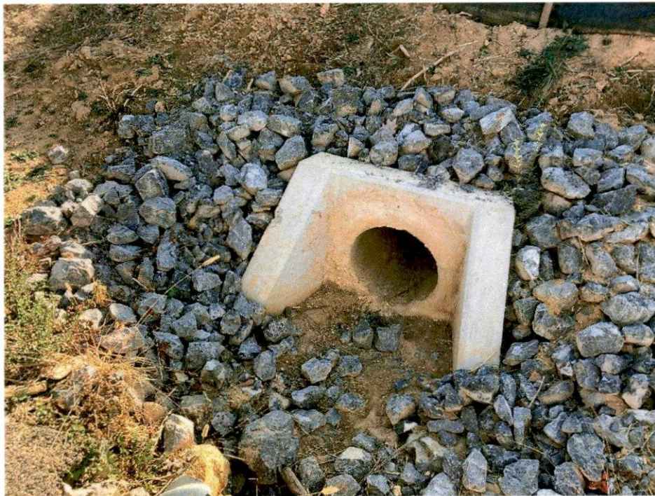
Evidence of sediment discharge at the sediment basin outfall