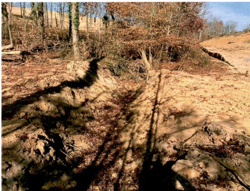
Unauthorized alterations to Malty Branch