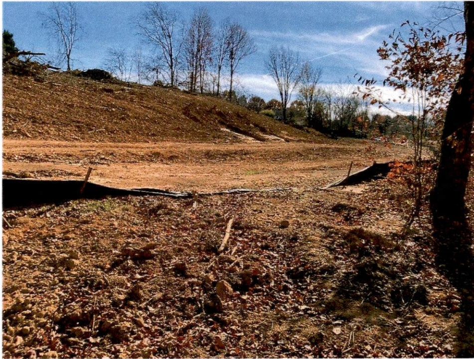
Failure to maintain BMPs above stream buffer and stabilize soil within the buffer

Project Name: Inspector: Inspection Date: