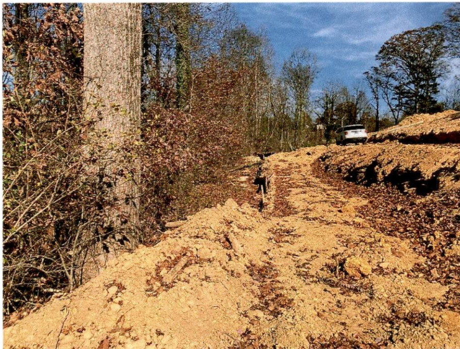
Disturbed soil below limits of disturbance which is also within the stream buffer. Potential for sediment discharge into Waters of the State