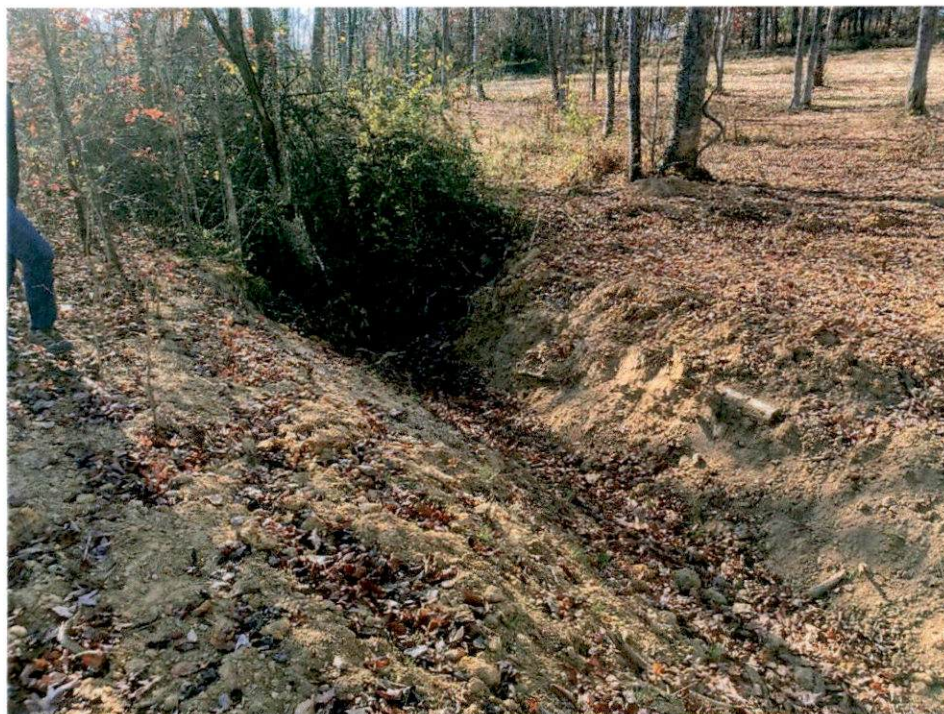
2 nd location of unauthorized alterations to Malty Branch