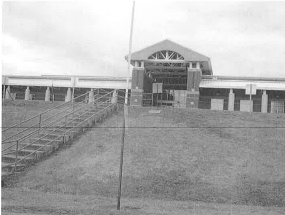
Heritage Middle School 3737 East Lamar Alexander Parkway