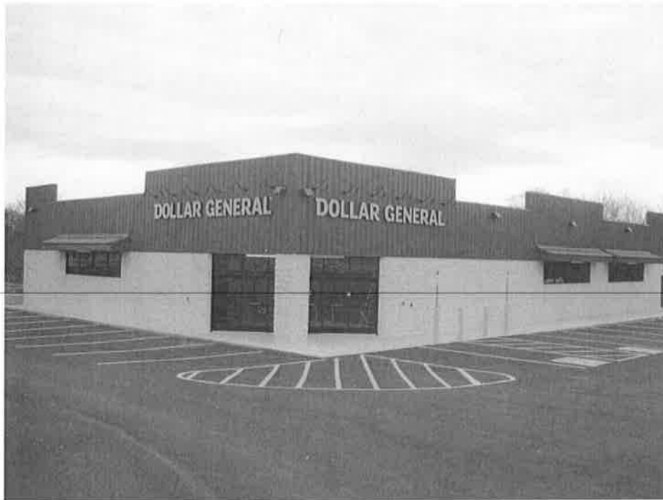
Dollar General Store #15888 3613 E. Lamar Alexander Parkway