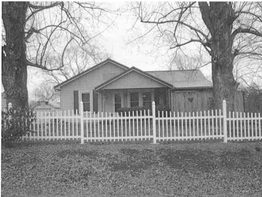
Nearest Residence 349 Helton Rd