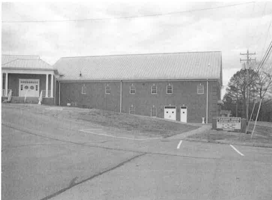
Pleasant Grove Baptist Church 3736 Tuckaleechee Pike